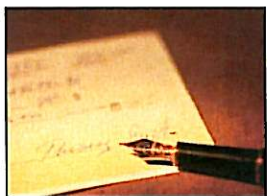
Learn profit proven strategies