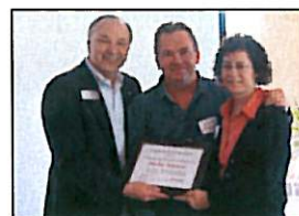
Get your team pumping.

1. One-to-One Mentoring Programs: These programs are designed for business owners who want to take aggressive action to grow their businesses as fast as possible.