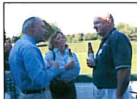
Network with other Professionals