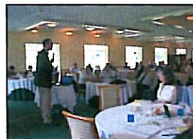
Create Your 90 Day Action Plan